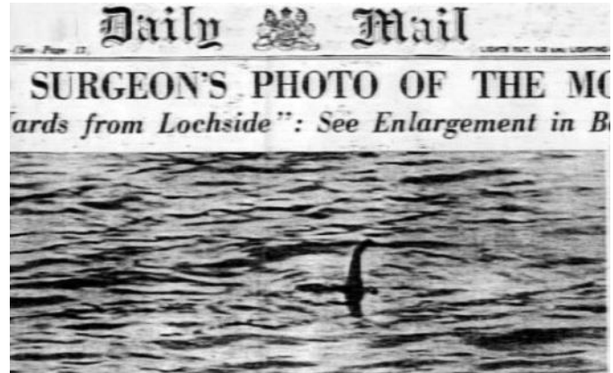
The first purported photo of Nessie was published in The Daily Mail on April 21, 1934.