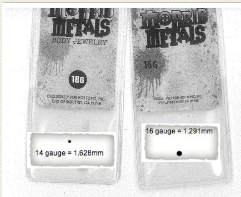
Lip Stud/Eye Brow