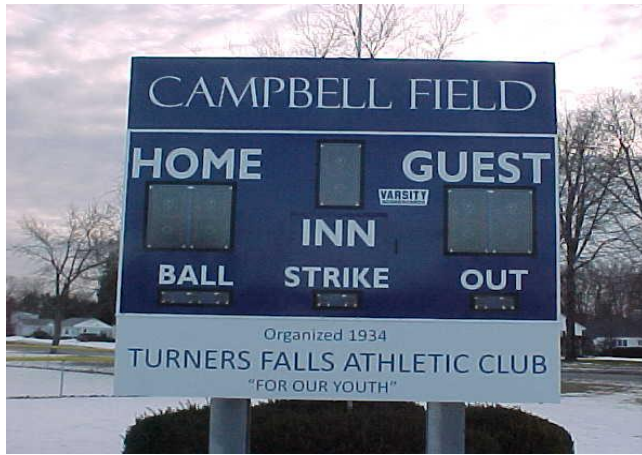
New Electronic Scoreboard