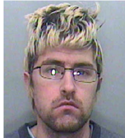
15-year-old girl on Facebook