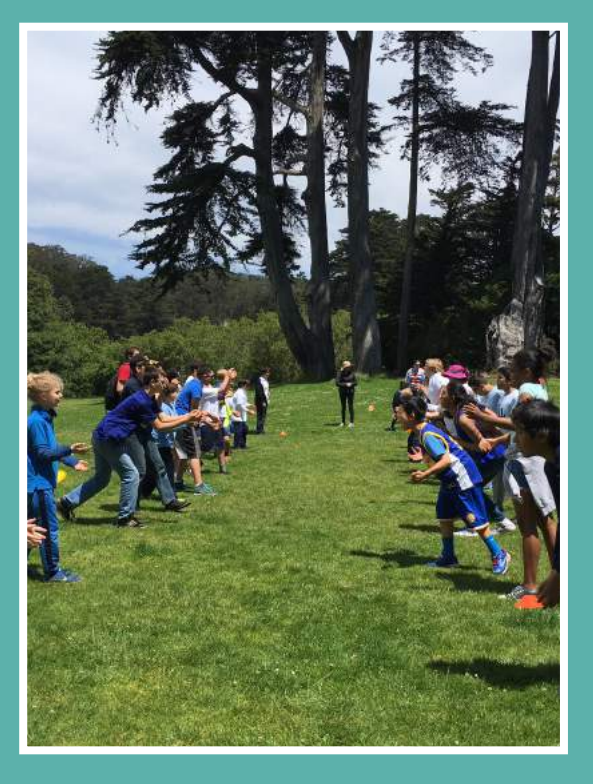
Join us for 5 weeks of exploration! June 26, 2017 - July 28, 2017