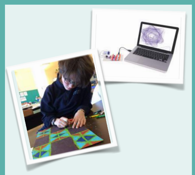
Working on beautiful art projects; Coding Etch-a-Sketch with littleBits kits.

Adding art and design to core subjects teaches children to think more broadly and allows them to solve problems in creative ways.