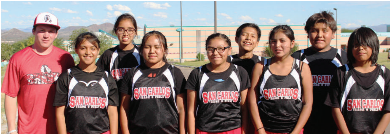
Junior High Cross Country