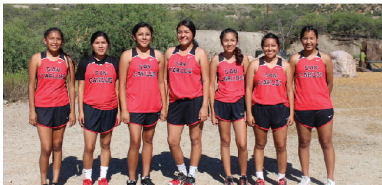
High School Girls Cross Country