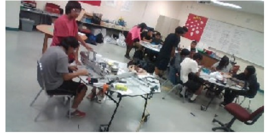
Students learn the science and technology of building robots

AzFIRST, which stands for AZ For Inspiration and Recognition of Science and Technology, is the second part of the course, encompasses the combination of the excitement of sport with the rigors of science and technology.