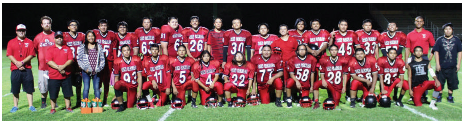
High School Varsity Football