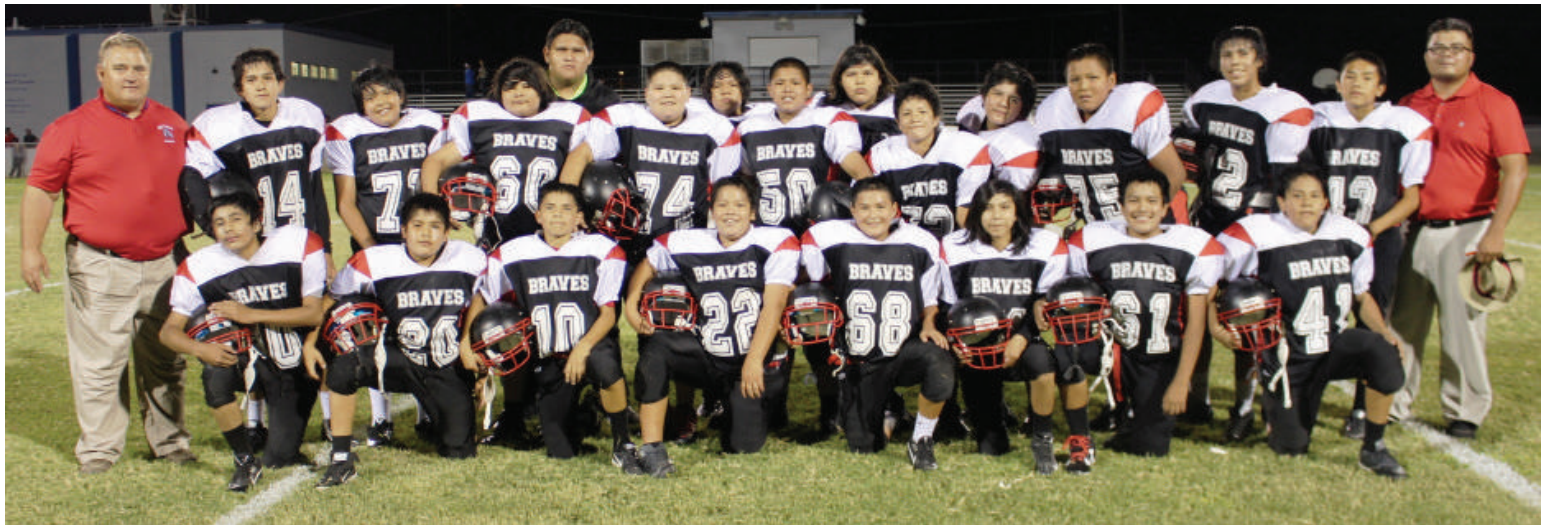
Junior High Football