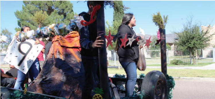
Homecoming Parade - Sophomore Float