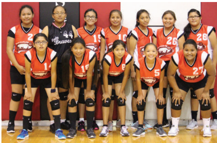
7th Grade Volleyball