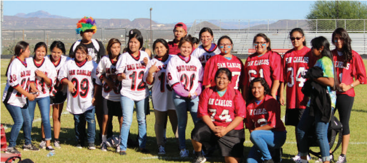
Homecoming Powder Puff Teams and Coaches