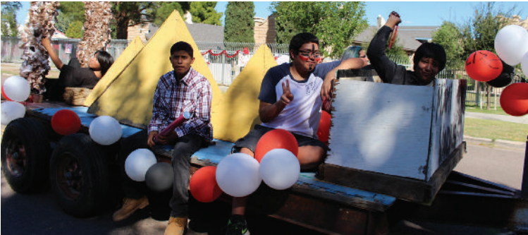
Homecoming Parade - Senior Float