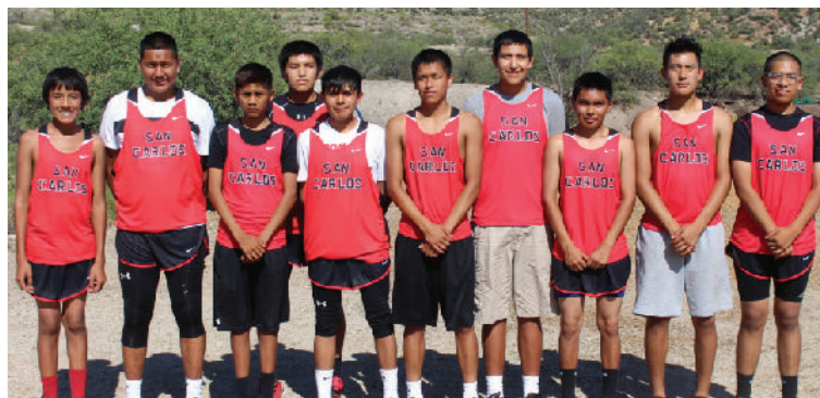
High School Boys Cross Country