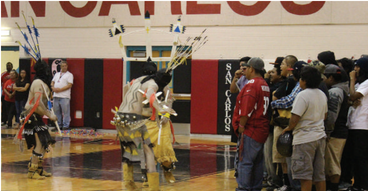
Homecoming Pep Rally - Crown Dancers