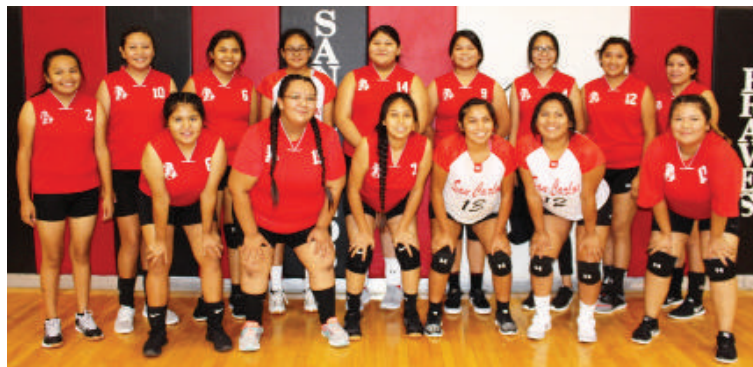
Junior Varsity Volleyball