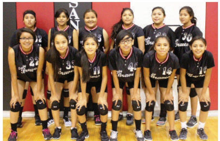
8th Grade Volleyball