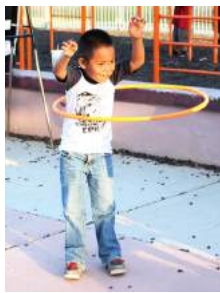
Hula hoop king!