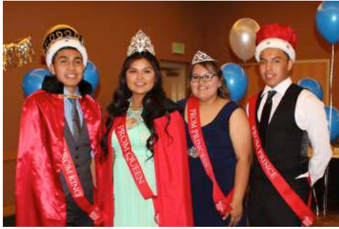
2016 Prom Court