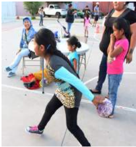
Bowling for prizes!