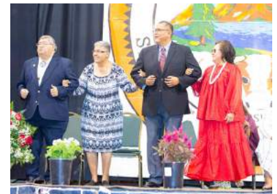
(above) Governing School Board Members