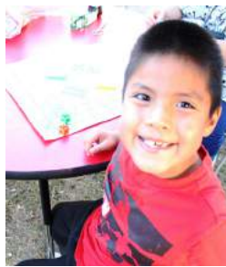
Time to play a game!