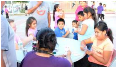
Card games going on at this table!