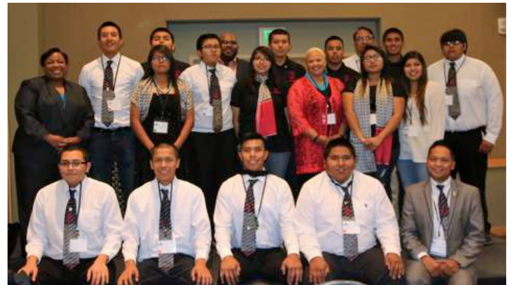
National Honor Society members with National Honor Society Directors

National Honor Society members attended the first National Honor Society National Summit in Albuquerque, New Mexico last month. SCSS NHS students were among the thousands of students from several states to attend this national summit. San Carlos Secondary School students participated in several workshops and brainstorming sessions to capitalize on what they could do to make changes in today's world. It was an exciting event and many of our students proved to be leaders in their groups as they led the discussions in the general session. The educational trip focused on the leadership of the National Honor Society members and it carried a sense of responsibility for the youth leaders of tomorrow. You can believe that our NHS members will definitely be driving our tribe into new directions when they are at the helm of making decisions for our tribe in the future!