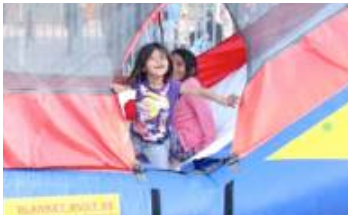
Kids enjoying the bouncy castles!

Leave it to Rice Elementary School to have the best family fun events for the their students and the community!