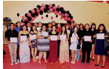
Students received awards from teachers

Congratulations to all the students who received scholarships, to those who joined the Armed Forces and the students who graduated and plan to pursue their dreams