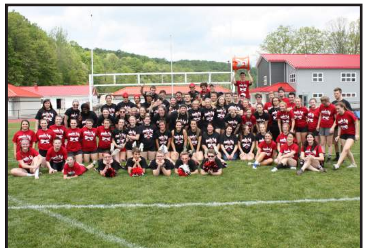
The junior and senior Powder Puff participants get together after the game.