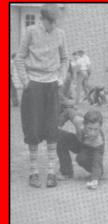
Taking a Break A group of students play marbles in the court yard.