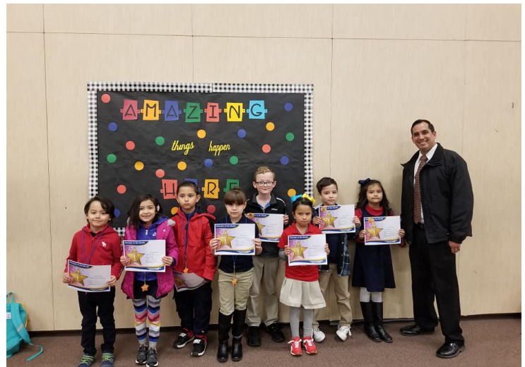
Kinder, First, and Second Cheetahs of the Month