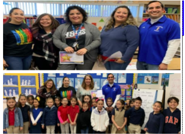
Cheetah Team of the Month Kindergarten Team