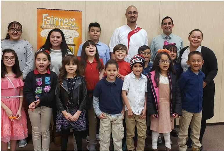
Character Counts Fine Dining with the Principal - Fairness