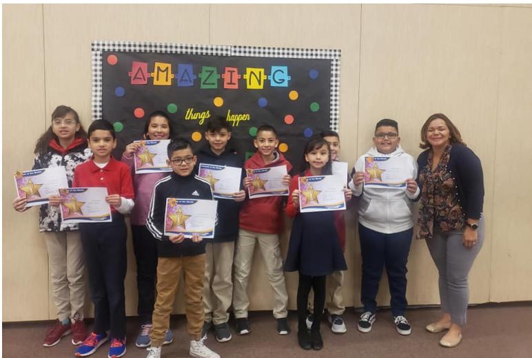
Third, Fourth and Fifth Grade Cheetahs of the Month