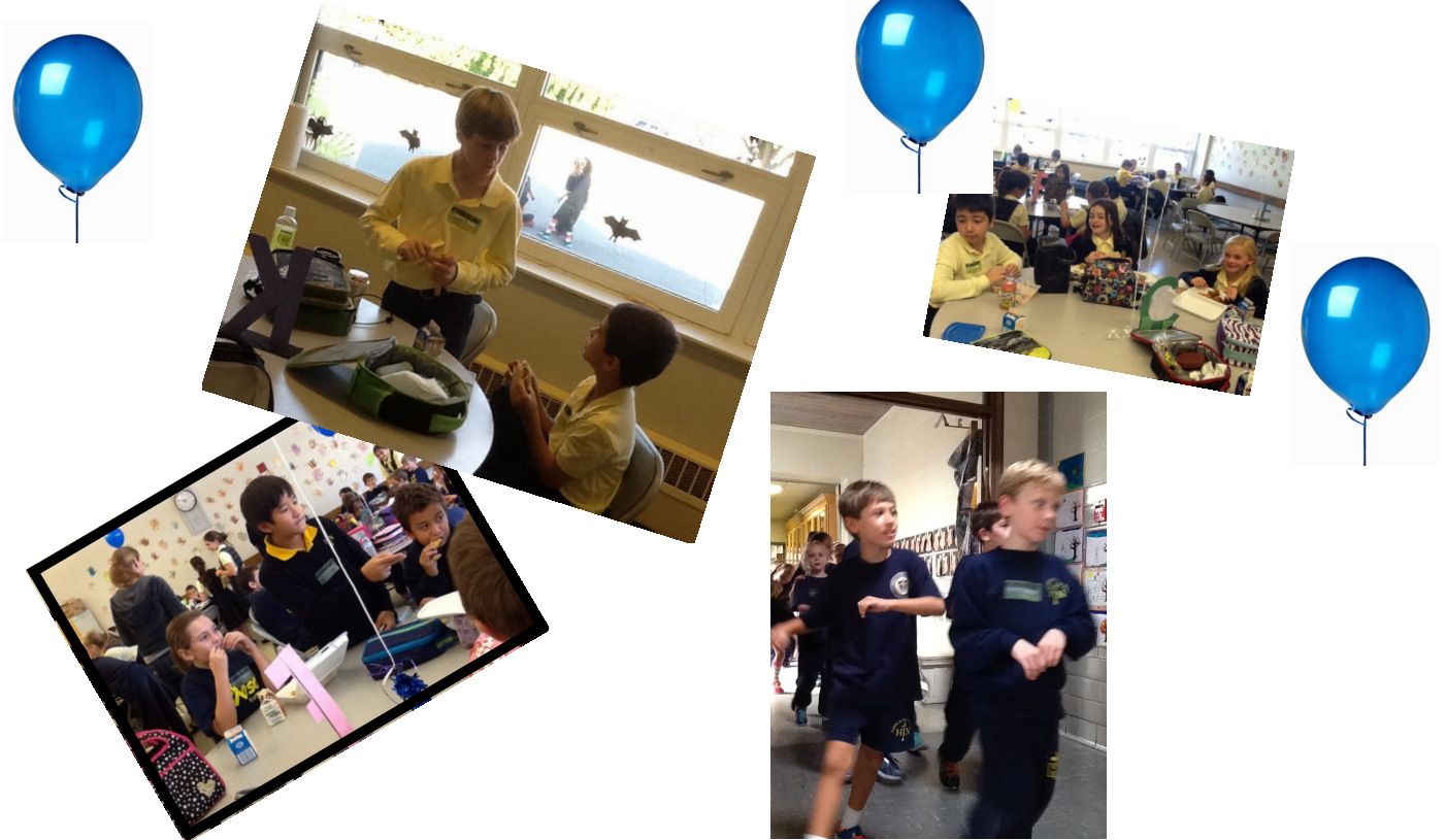
Feathery Focus in grade 3