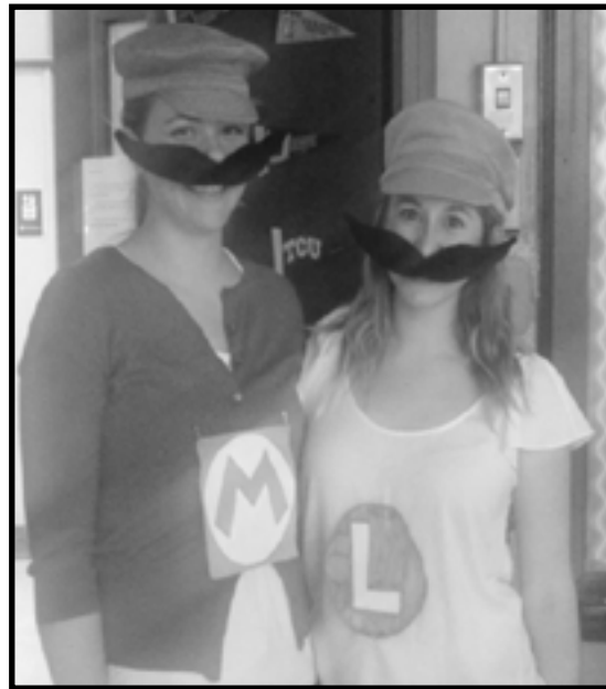
Hey Super Mario Brothers