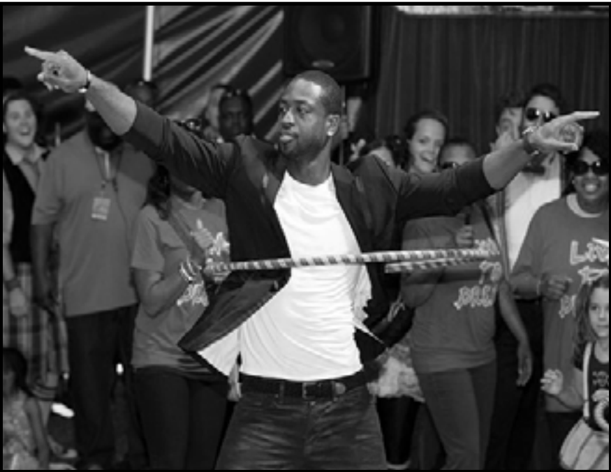
Miami Heat star Dwyane Wade hula- hoopin’ at Douglas Park