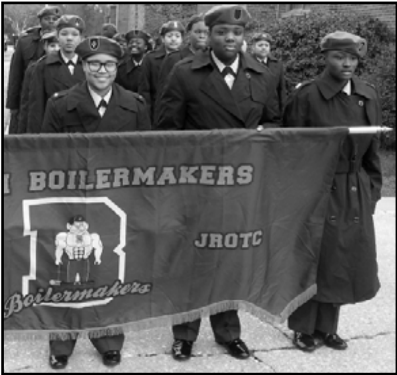
Boilermakers show their patriotism while representing Bowen in the Veteran's Day Parade