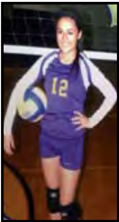
2013 Varsity Volleyball Team