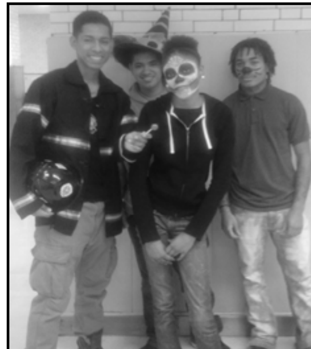
Trick or Treat