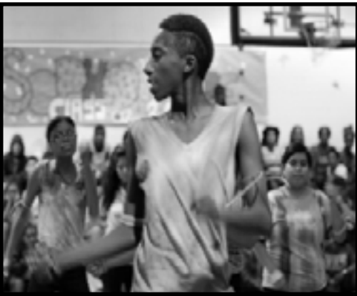
Cheerleaders dancing to the beat