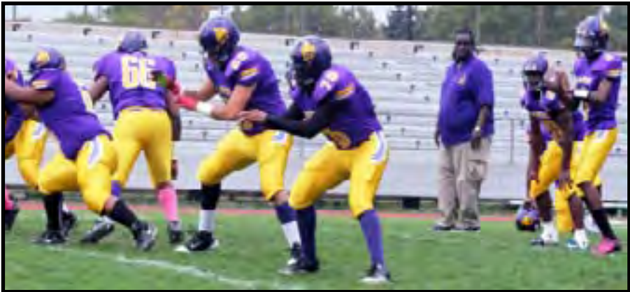
Boilermakers make their move at the homecoming game and grab a 16-8 victory

The season wasn't all losses. Bowen won their first game in week 7 when they faced Carver High School in the homecoming game. With Carver scoring on the first drive of the game, Bowen kept their spirits high and scored on the