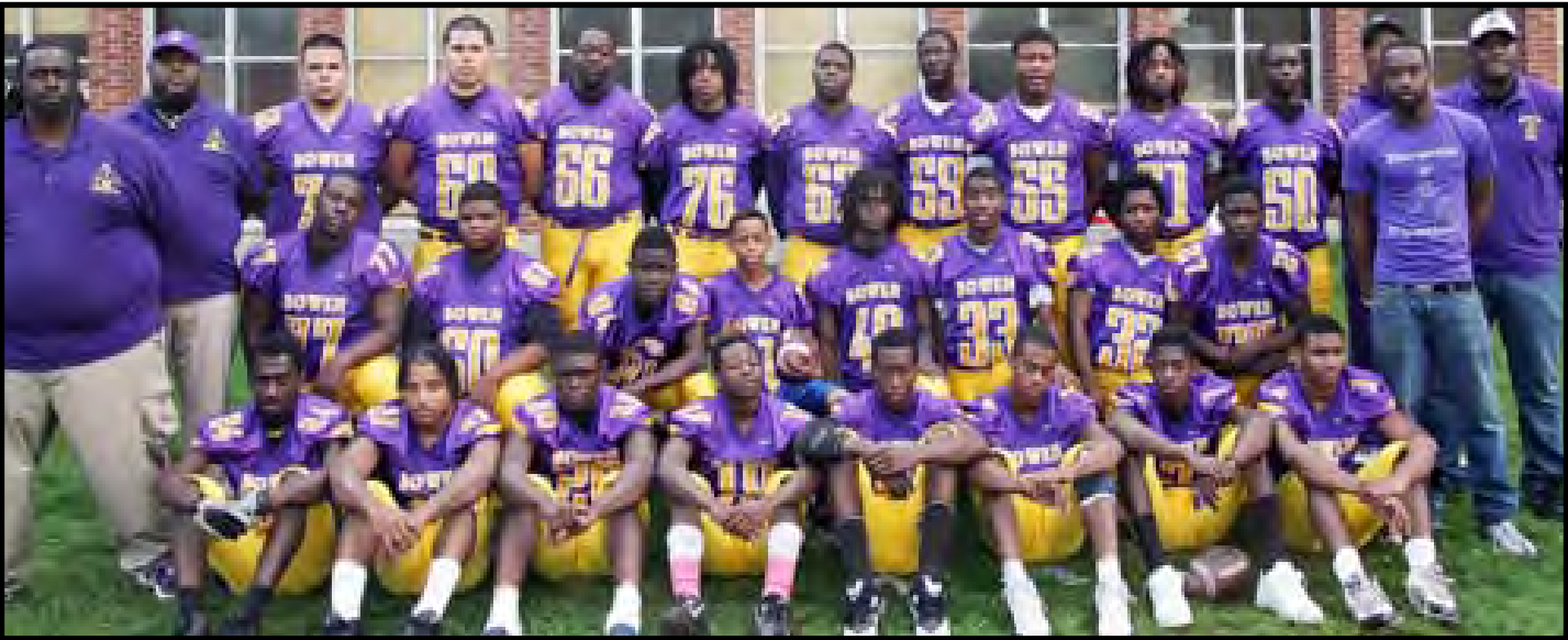
2013- 2014 Boilermaker Football Team