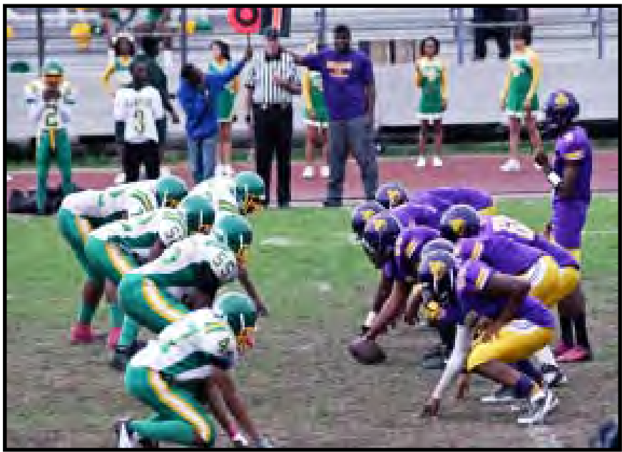
Carver and Bowen face off. "Get ready, set, Go Boilermakers!"