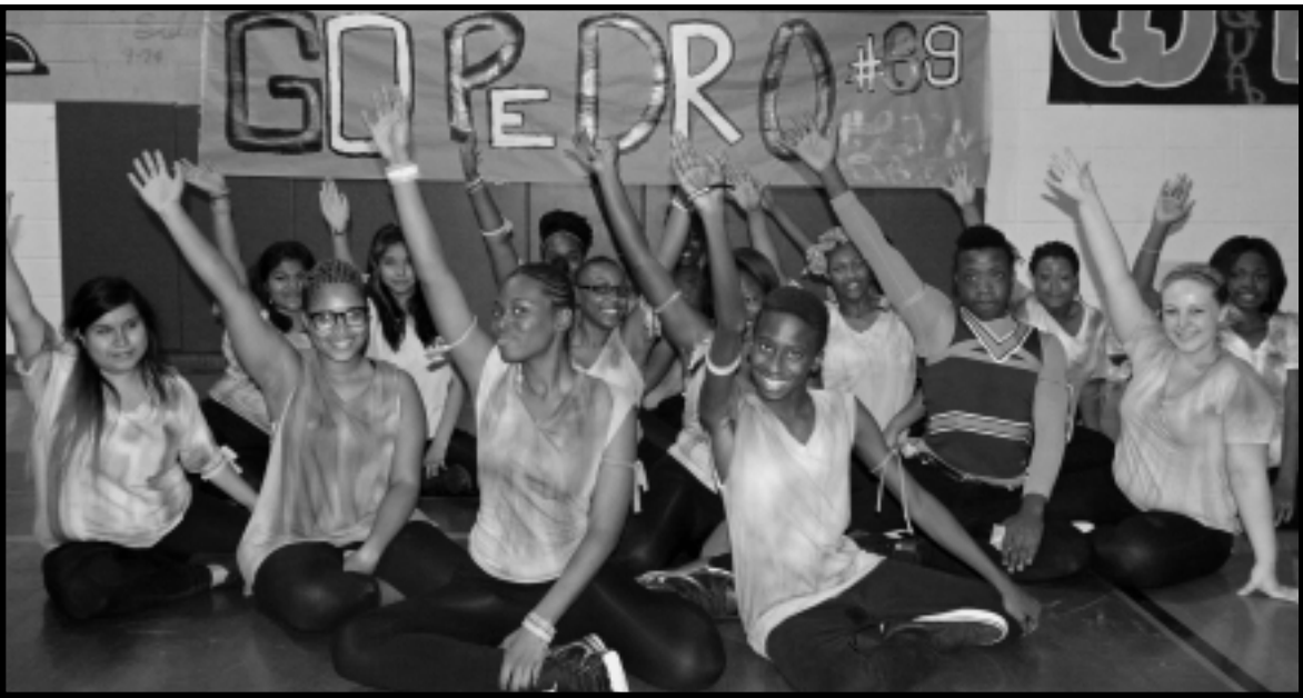
The cheer squad gets ready to perform at the homecoming pep rally