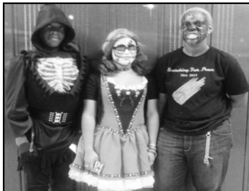
Spooky Kids in the hall