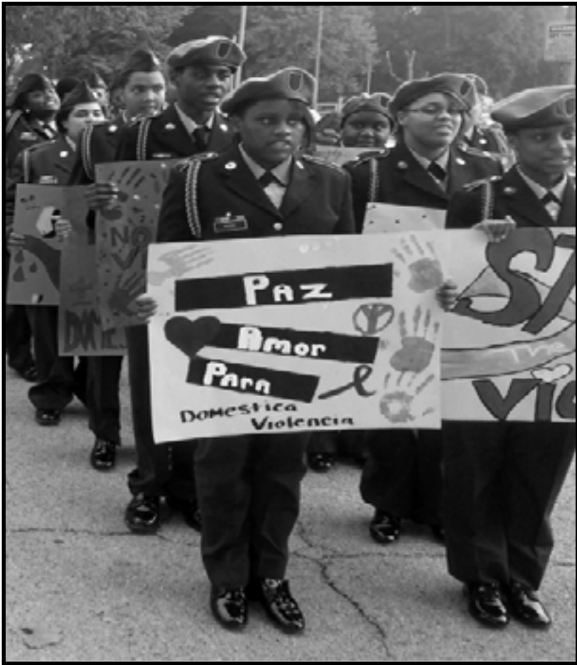
JROTC march against domestic violence this past October- Domestic Violence Awareness Month