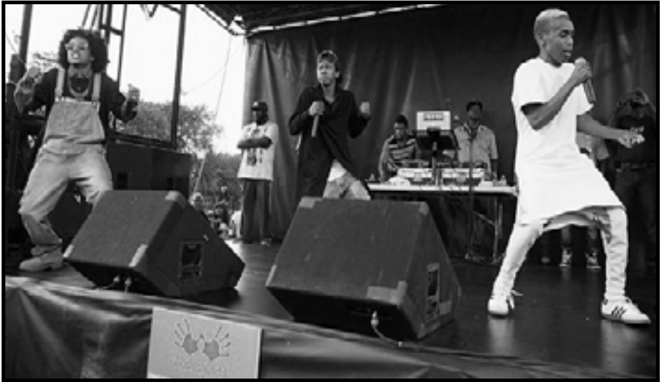
Mindless Behavior wows the crowd at the “Choose to Live, Live to Dream” fest held in September