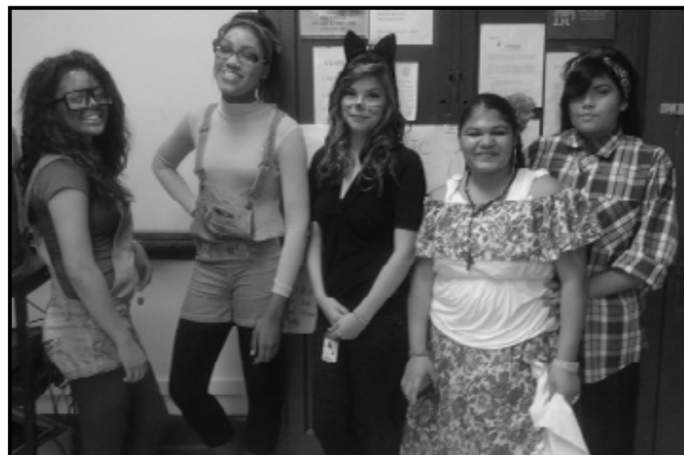
A mixed bunch of minions, kitty, and Mexican culture