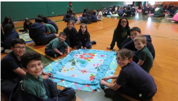
Faith Families Making Fleece Tie Blankets for Rooms of Hope