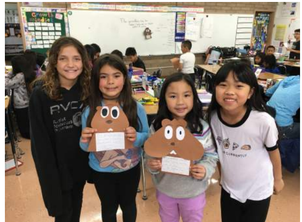
First & Fifth Grade Buddy Activity