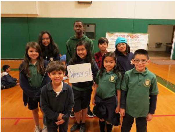
Faith Family Feud Winners