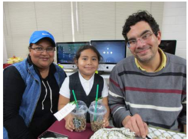
Showing Appreciation for Our Staff