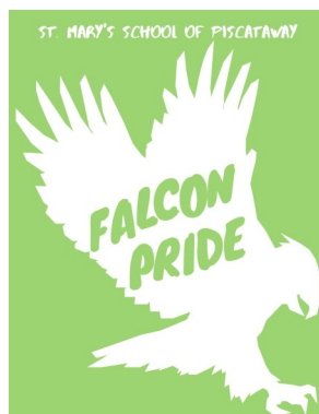
Class of 2028