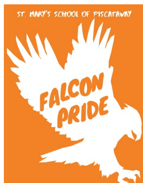
Class of 2025