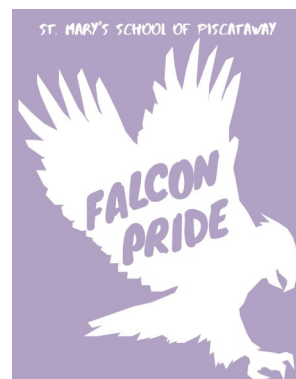
Class of 2029