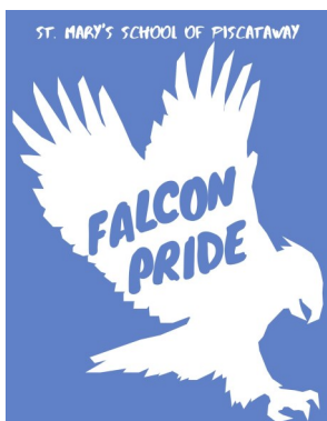
Class of 2022