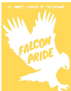
Class of 2026