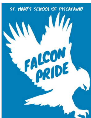
Class of 2027