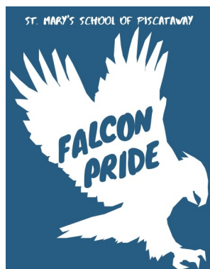
Class of 2020