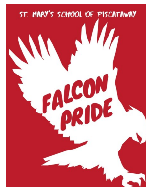
Class of 2024