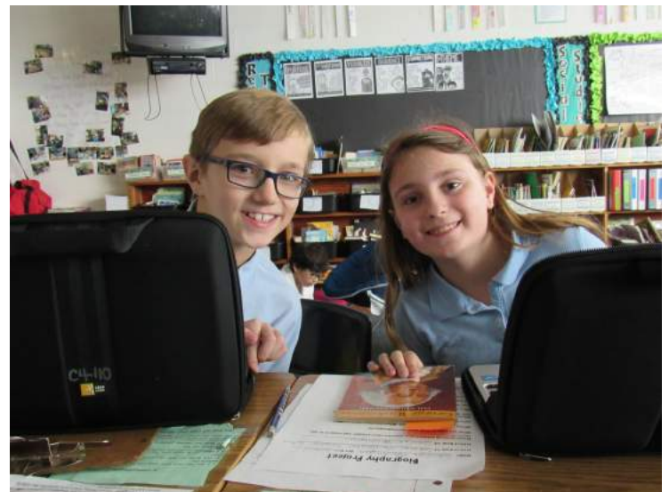
Delta Science Kits - Chrome Book Computers Enhance our Classical Curriculum