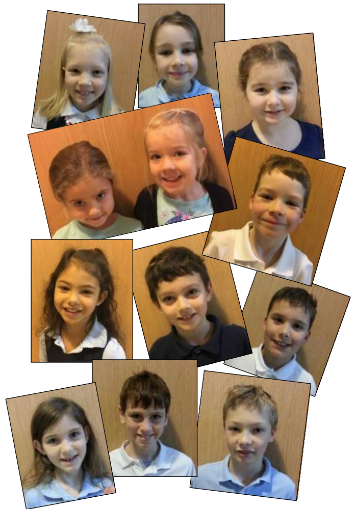
Pictured above: Some of the elementary Virtue Voucher Raffle winners from the end of the month drawings.