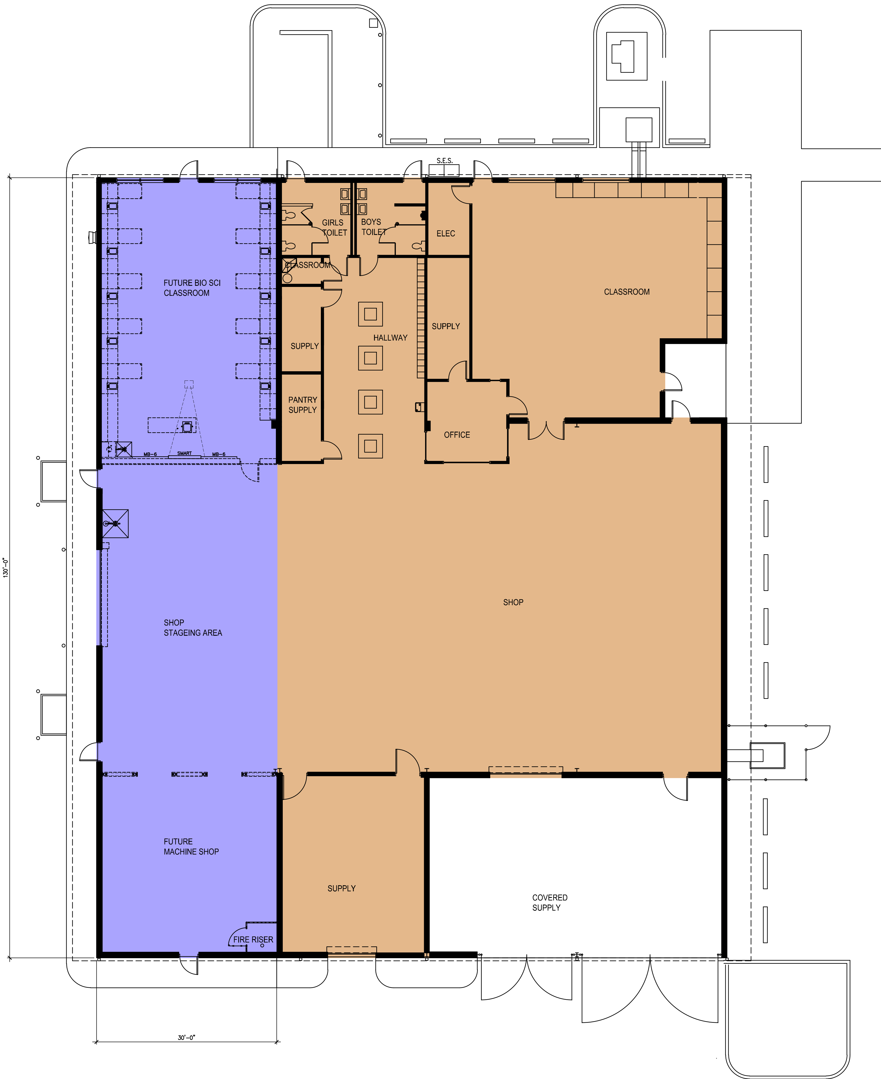
BUILDING 'U' FLOOR PLAN - 12,035 S.F.

Plot Date: 4-15-14 10:35am Drawing scale: 1/8" = 1'-0" User: hda\jacob\1328_Present Ag Bldg Last Saved: 4-15-14 10:34am