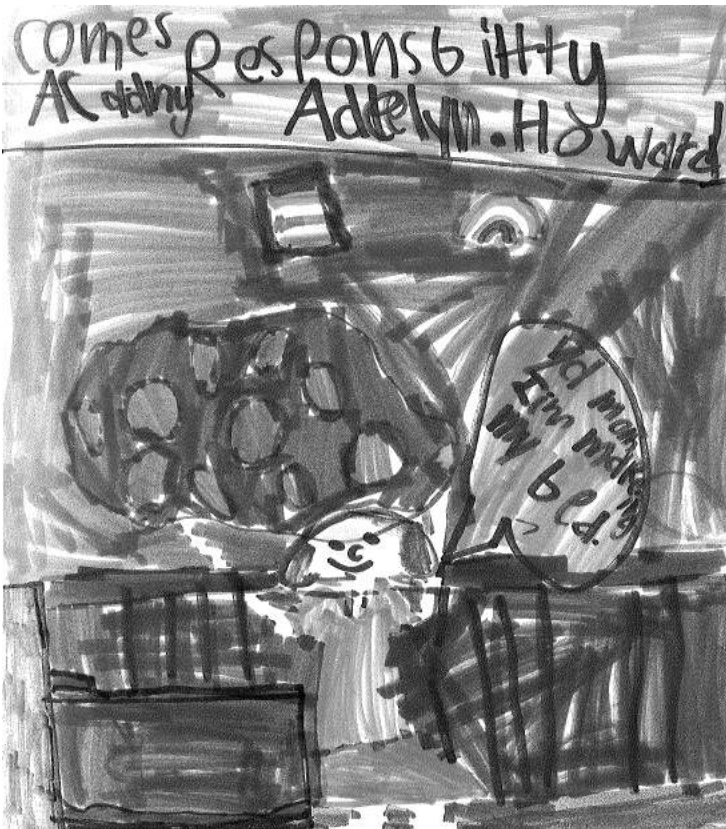
Illustration by Ady Howard-1st grade