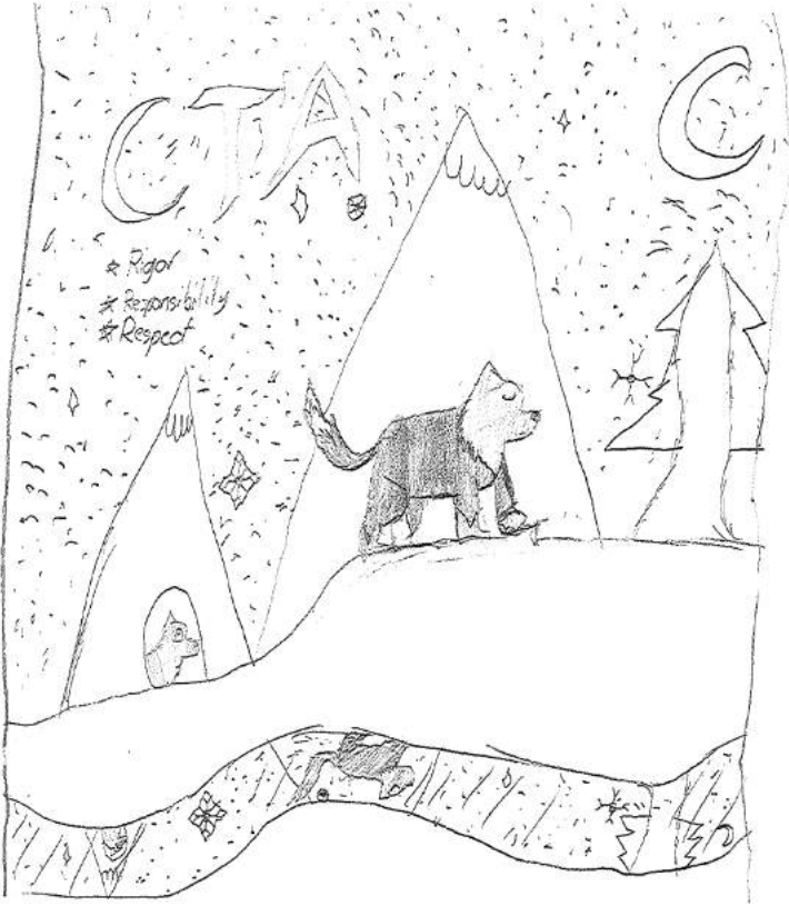
Illustration by Sylvia Sterling-5th grade