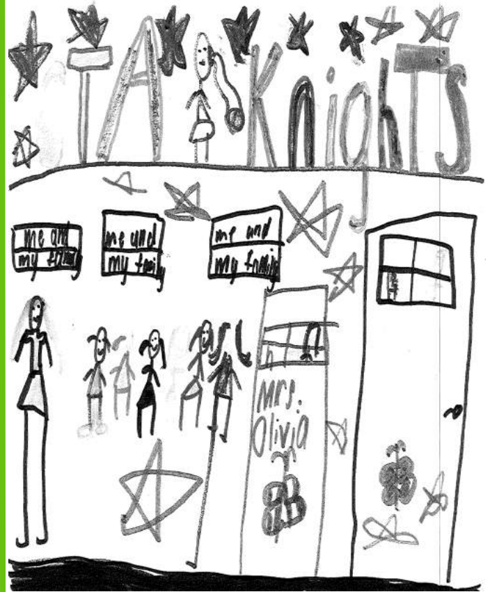
Illustration by Uchechi Ubosi-1st grade