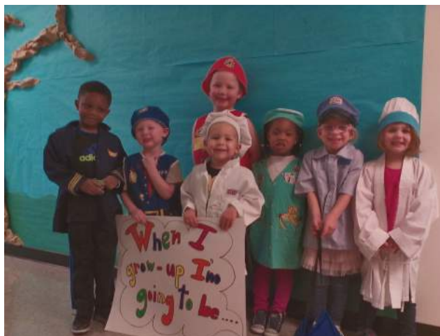
Career Day with the Little Aztecs