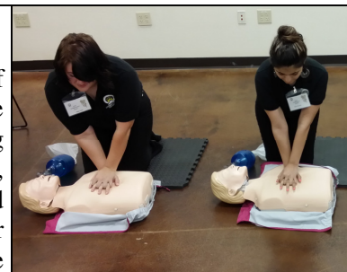
Students practice their rounds of 30 compressions.

Students attending CAVIT's first year programs are busy learning the importance of health care and education through the school's required CPR and AED training. Some 400 students will complete and sit for their CPR technical skill and written test during the first 9 weeks of school. To ensure that CAVIT can train large numbers of students, teachers attended summer training to become certified instructors. CAVIT added equipment for CPR instruction including dummies and AED machines to allow for classroom groups to learn together. Students need CPR certification in order to serve community residents in CAVIT's campus clinics, in addition to, applying their skills in upcoming work-based internships at area healthcare facilities. Students will attend a school assembly on October 10, 2014 where they will receive their CPR card offered through American Red Cross, as well as, hear lifesaving stories from invited guest speakers. Certification in CPR is highly valued at CAVIT as this is our students' first industry certification that most employers require.