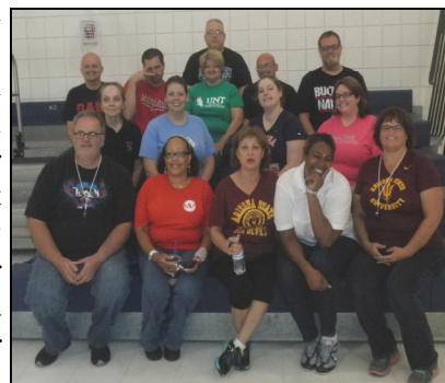
Staff pose for a picture wearing their game day attire.

chosen career areas i.e. hand washing, handcuffing and animal restraint to name a few topics taught. The tenth day of school concluded with CAVIT's Nacho Regular School Day event where students brought in every conceivable food item that could be piled on top of tortilla chips eating and socializing with students from other programs. From the student survey results on our first 10 days, our teachers' efforts to build student relationships and to provide career awareness was a huge success.