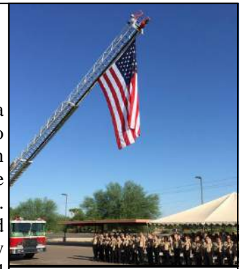
Law students assemble under the flag for the start of the program.