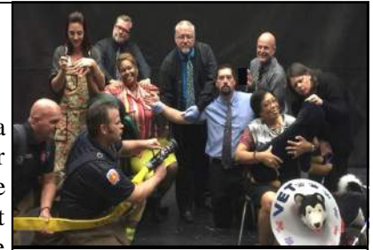
CAVIT Teachers are like fine art!