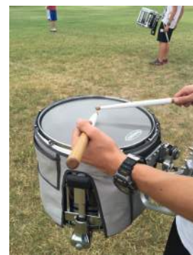
Page High marching band

Have your kids take music classes, support your school's music programs, and watch student achievement improve across the board!