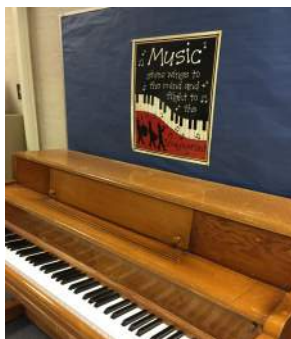
Class piano at Lake View

From playing classical music to a child in the womb, singing a baby to sleep, attending powwows to teach heritage and tradition, learning the