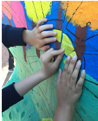
Teamwork while placing glass pieces on the statue.